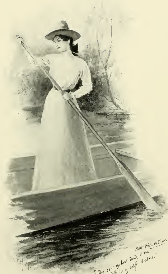
MARY WARE IN TEXAS "She sent the boat down with long swift strokes."